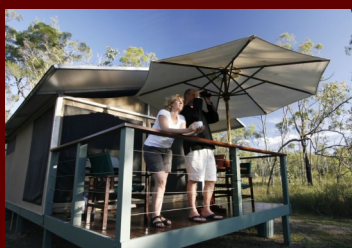
Deluxe Safari Cabin

The successful Cairns Highlands Bird Week is in its fourth year and we are pleased to offer 2 bird week experiences for 2011.